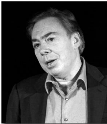
Andrew Lloyd Webber

Travelling late to a meal one night in 1973, though, Rice heard the end of a radio show about Eva Perón which intrigued him. As a child stamp collector, he'd been fascinated by her image on the Argentine stamps, but was unaware of her significance in Argentina's history. He began research and was introduced by a Cinema